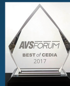
AVS FORUM BEST OF CEDIA -2017-